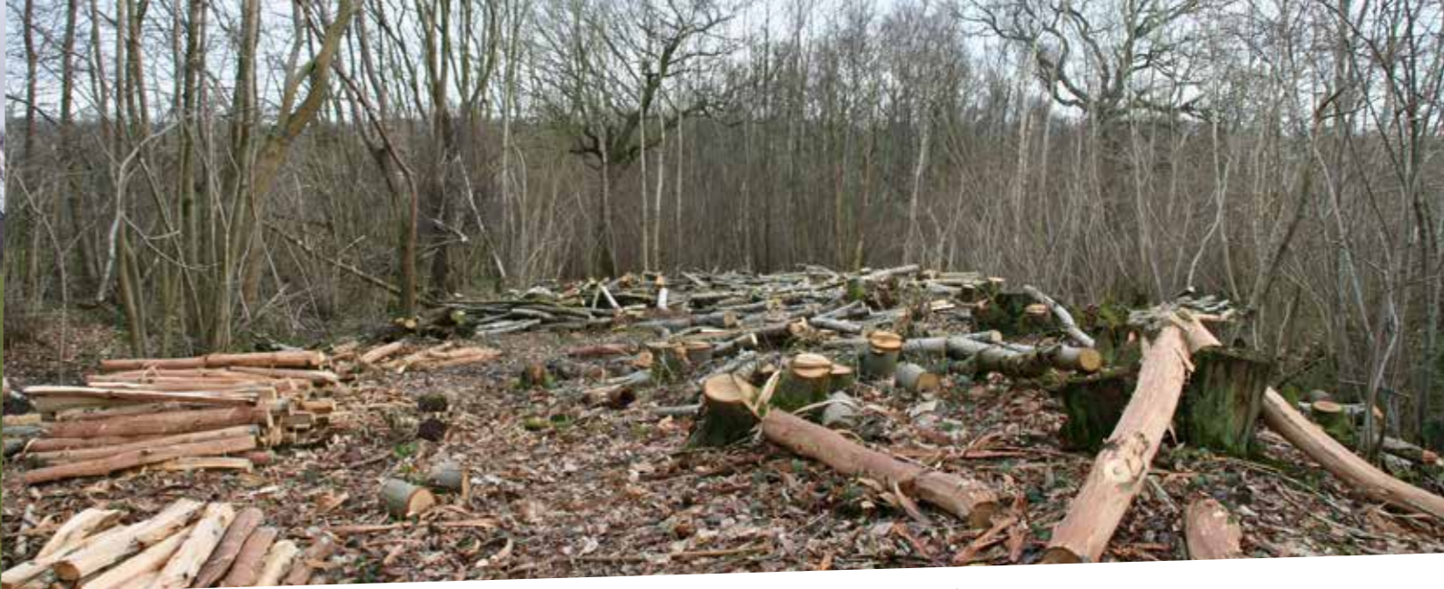
▲ CHESTNUT COPPICE – PILES OF TIMBER

Bill says: “Under HLS, the hedges are now cut every other year to provide food and berries for wildlife. We have also done some hedgerow restoration. On the arable land, we have wild birdseed cover