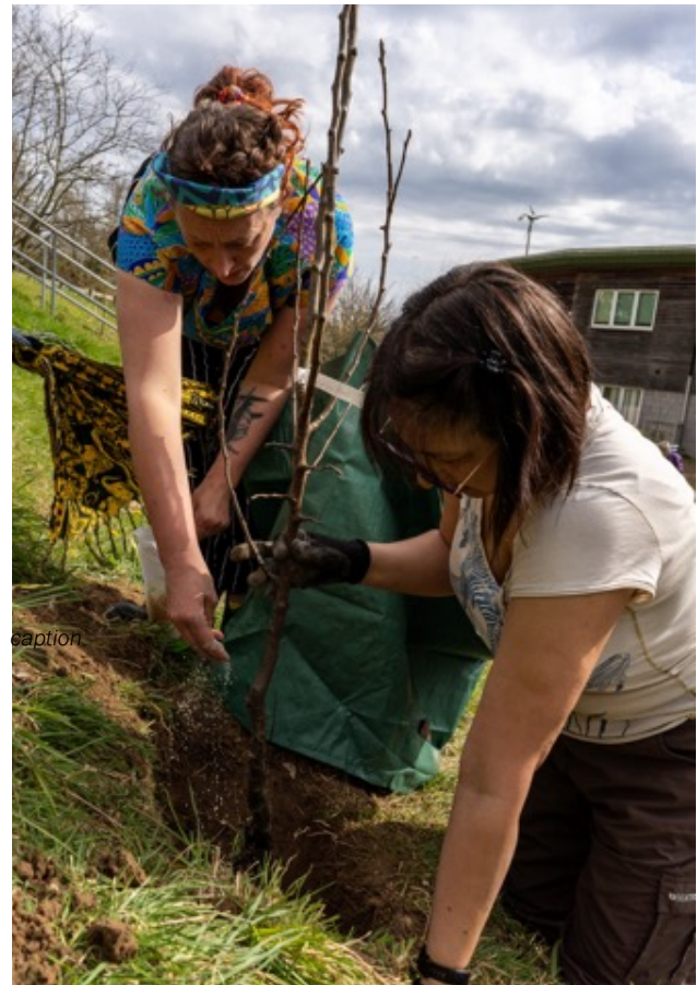
Volunteers planting at Wellsbourne