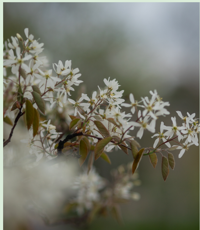
Amalanchier in flower