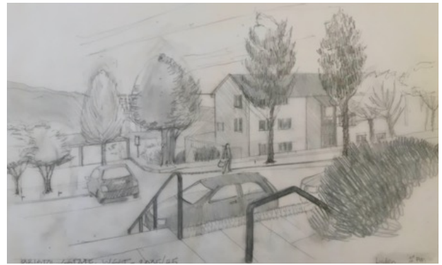
Artists impression of the proposed tree planting at the end of Bowring Way

Bristol Estate's ambitious nature loving residents are working to 'green up' the estate and we are helping them to achieve this. The initial stage of the plan we've developed is to plant 20 major street and amenity trees with a mix of tree species, including, pines, hornbeam, lime, flowering pear, disease resistant elm, and wild service trees, to diversify the City's urban forest. This initial planting will be in two phases starting in the autumn. We hope to plant the first tree at the Estate's 'Nature Day' in October.