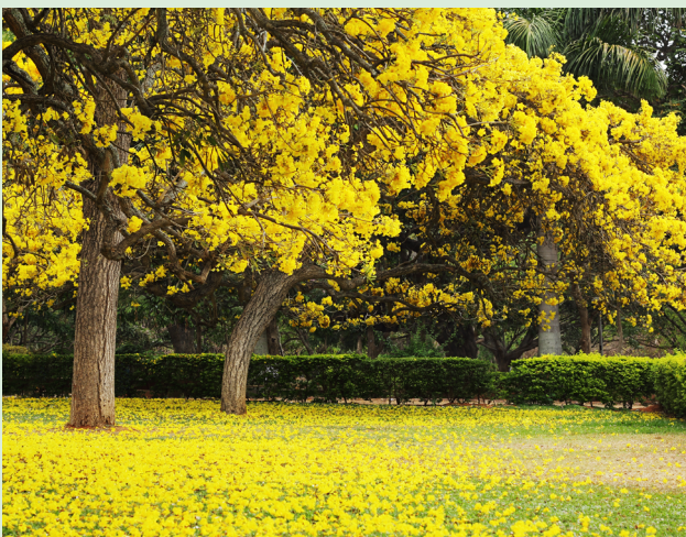
Witch hazel tree

Preston Manor gardening volunteers will be planting three new trees, a medlar, an amalanancier and a witchhazel, in the Manor's Edwardian Walled Garden to replace those lost. The trees are now being stored for planting in the autumn.