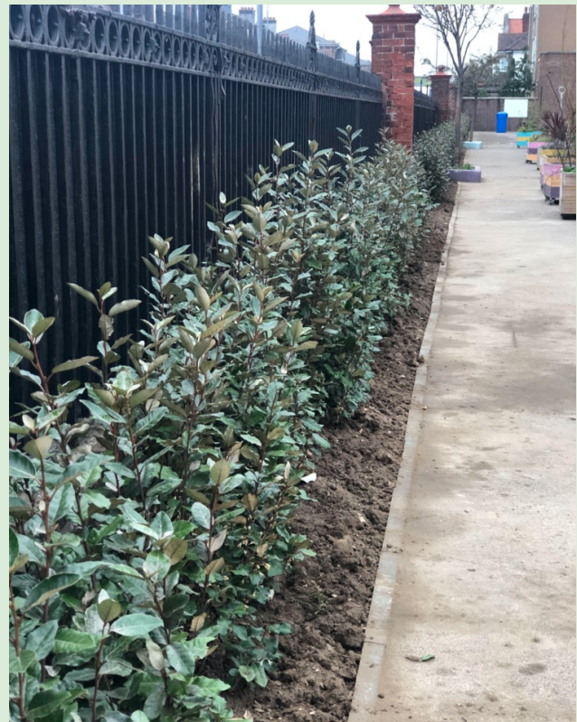
Evergreen hedge at West Hove School