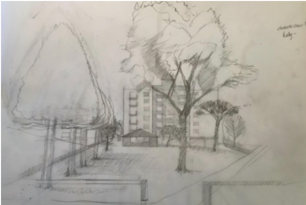
The view north looking towards Community Centre along Chadborn Close Close